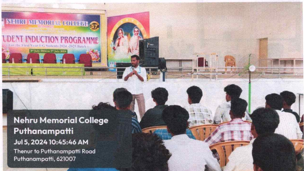
Nehru Memorial College Puthanampatti Jul 5, 2024 10:45:46 AM Thenur to Puthanampatti Road Puthanampatti, 621007